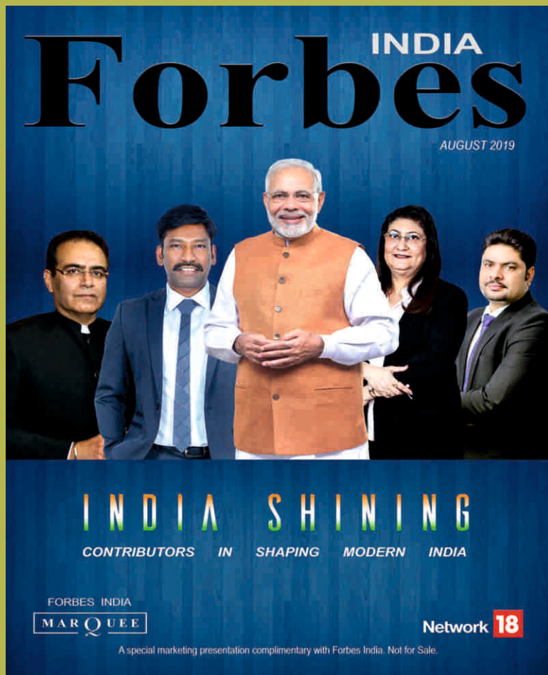
One of the Leading Global Business Magazine 'FORBES' have come out with a special coverage on our company Lifespan Pvt. Ltd.