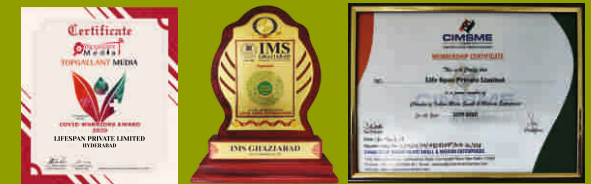
Lifespan Pvt. Ltd. Winner of India 500 Start-up Awards for Quality Excellence 2019.